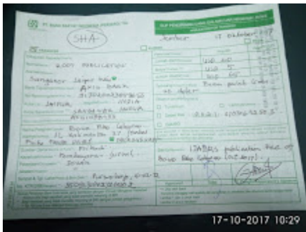
IJAERS Payment receipt.jpg 2031K